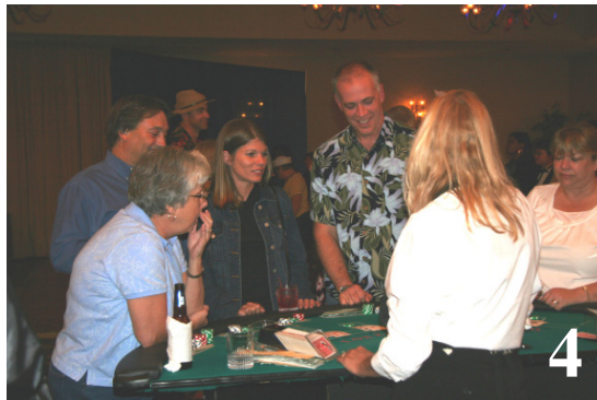
4 - Trying to beat the dealer.