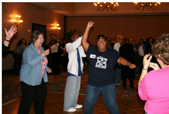
Enjoying the Cruise and Casino Party