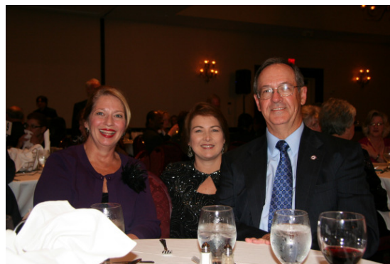
Enjoying the Presidential Gala!