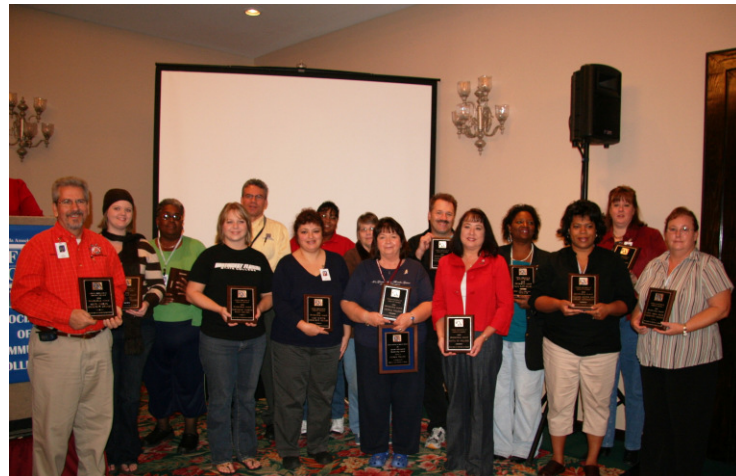
Chapter Membership Award Winners for 50% or More Members

In Recognition of 100% Full-Time Employees as Members Chipola College