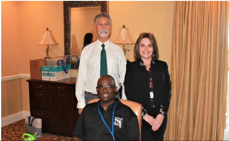
The Technology Commission Board members who are present at the AFC 70th Annual Meeting and Conference on Nov. 7, 2019.