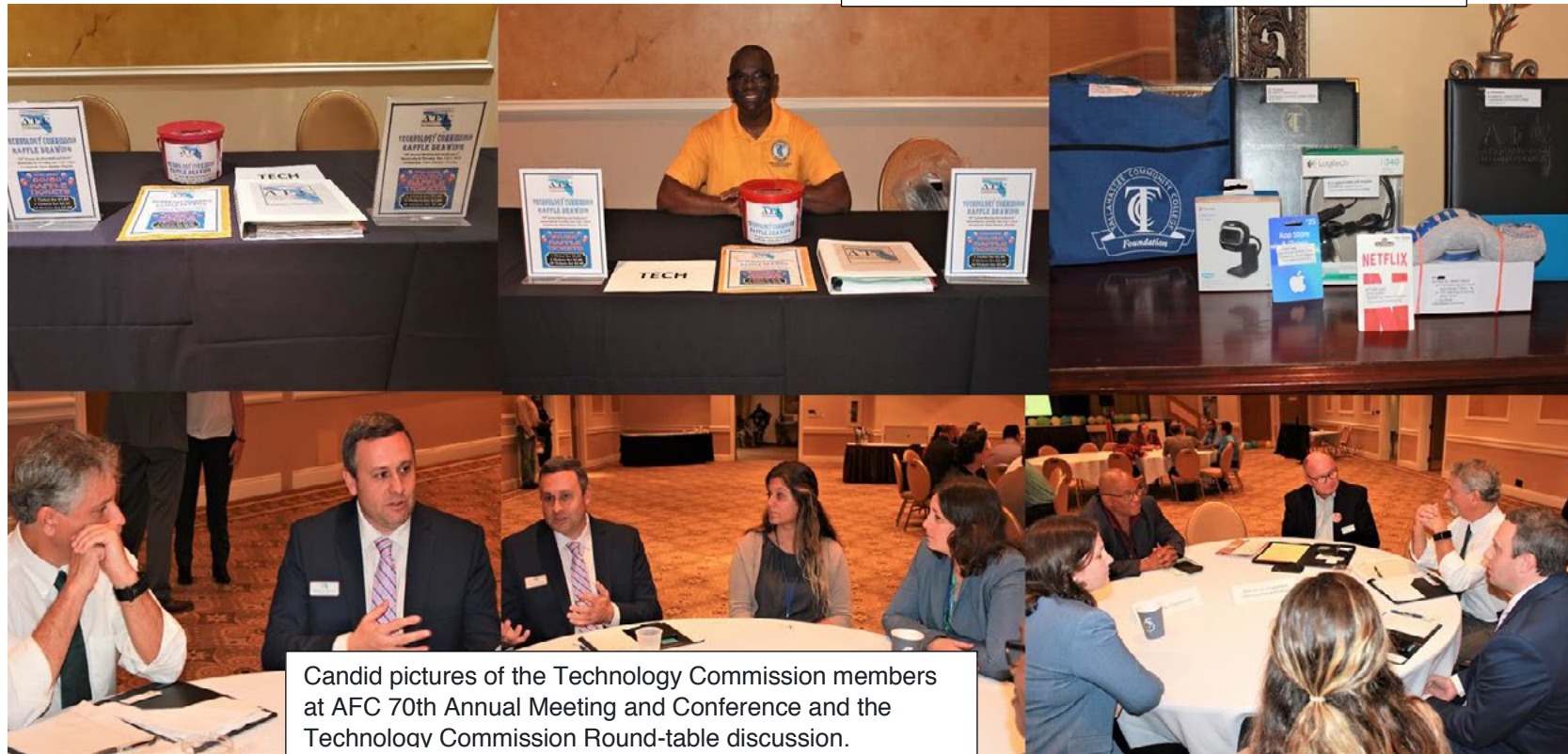
Candid pictures of the Technology Commission members at AFC 70th Annual Meeting and Conference and the Technology Commission Round-table discussion.