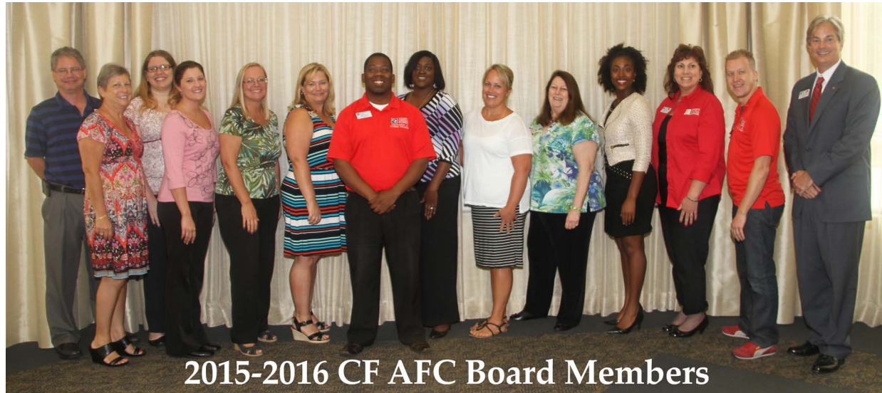
2015-2016 CF AFC Board Members