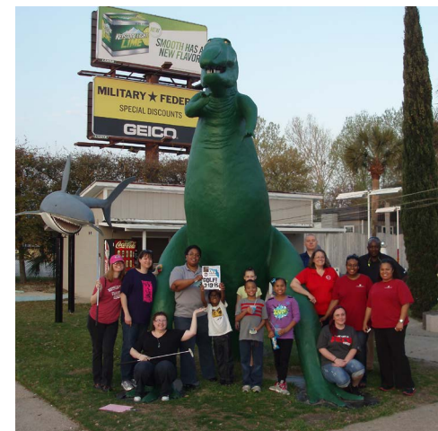
NWFSC AFC Chapter takes on Goofy Golf