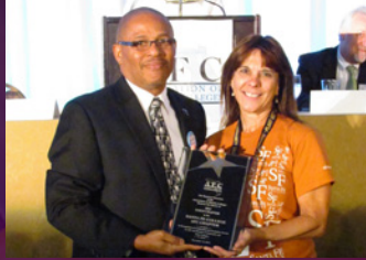
SANTA FE COLLEGE AFC CHAPTER