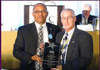
LAKE-SUMTER STATE COLLEGE AFC CHAPTER