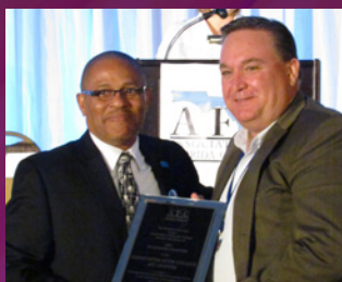
INDIAN RIVER STATE COLLEGE AFC CHAPTER