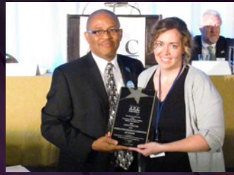
FLORIDA STATE COLLEGE AT JACKSONVILLE AFC CHAPTER