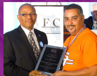
SOUTH FLORIDA STATE COLLEGE AFC CHAPTER