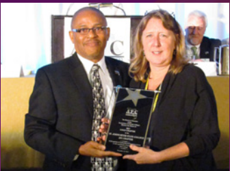
ST. JOHNS RIVER STATE COLLEGE AFC CHAPTER