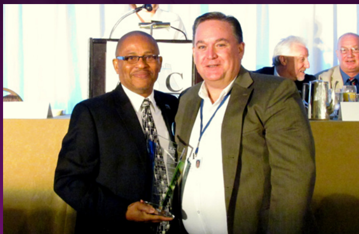
INDIAN RIVER STATE COLLEGE AFC CHAPTER