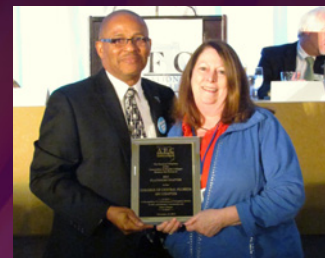
COLLEGE OF CENTRAL FLORIDA AFC CHAPTER