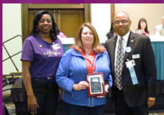
COLLEGE OF CENTRAL FLORIDA