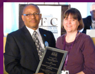
NORTHWEST FLORIDA STATE COLLEGE AFC CHAPTER