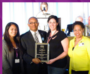
SEMINOLE STATE COLLEGE AFC CHAPTER