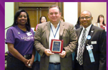
INDIAN RIVER STATE COLLEGE