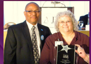
PASCO-HERNANDO COMMUNITY COLLEGE AFC CHAPTER