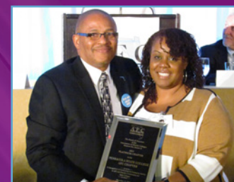
PENSACOLA STATE COLLEGE AFC CHAPTER