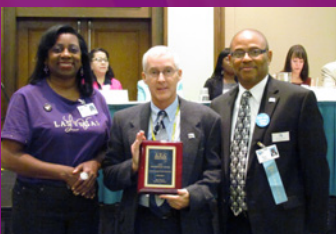
LAKE-SUMTER STATE COLLEGE