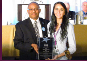
EASTERN FLORIDA STATE COLLEGE AFC CHAPTER