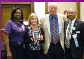
POLK STATE COLLEGE