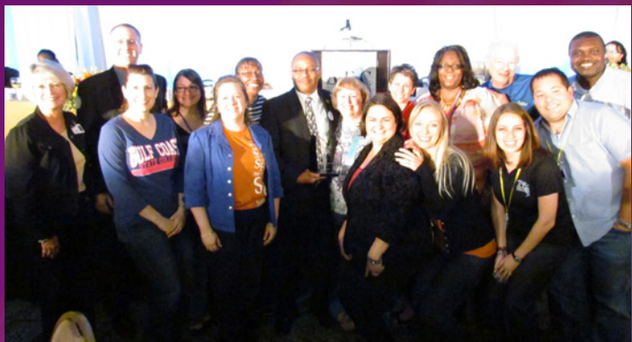
STUDENT DEVELOPMENT COMMISSION