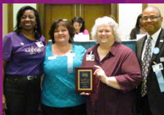
PASCO-HERNANDO COM. COLLEGE