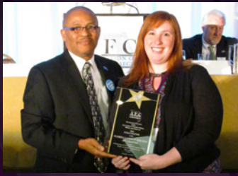
FLORIDA GATEWAY COLLEGE AFC CHAPTER