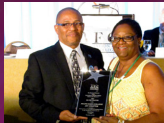
MIAMI DADE COLLEGE AFC CHAPTER