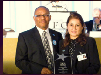
BROWARD COLLEGE AFC CHAPTER