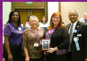
FLORIDA GATEWAY COLLEGE