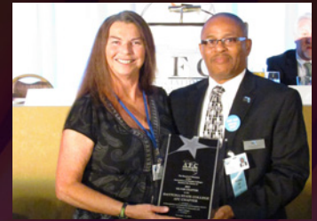
DAYTONA STATE COLLEGE AFC CHAPTER