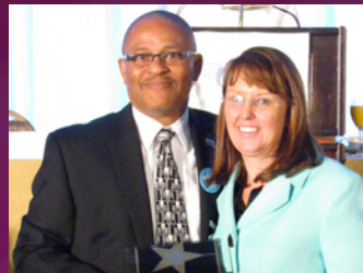
VALENCIA COLLEGE AFC CHAPTER