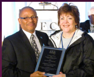
CHIPOLA COLLEGE AFC CHAPTER