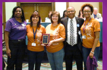
SANTA FE COLLEGE