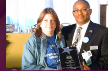
HILLSBOROUGH COMMUNITY COLLEGE AFC CHAPTER