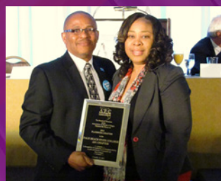
PALM BEACH STATE COLLEGE AFC CHAPTER