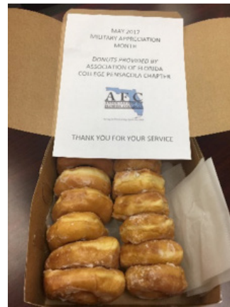
Donuts for Military Appreciation Month.