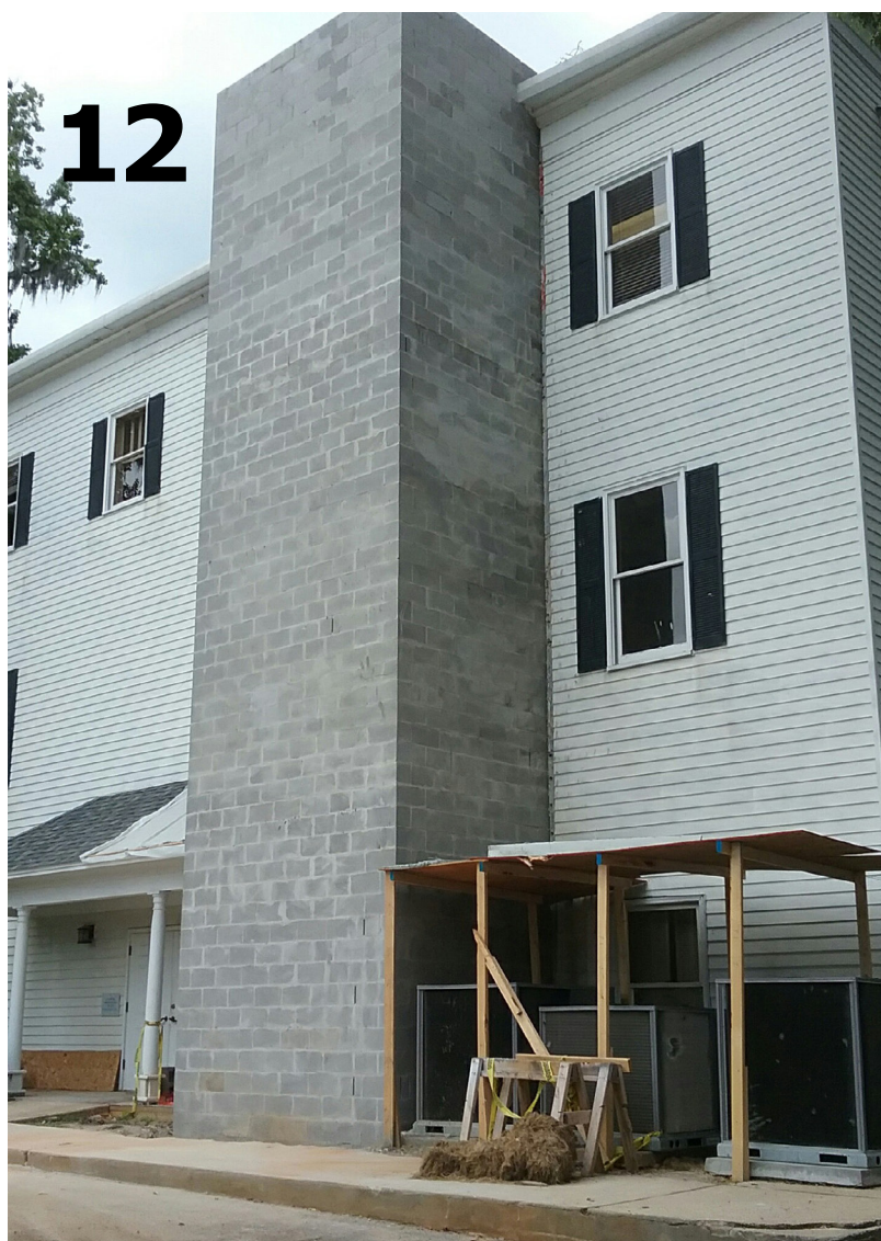
Progress is being made on the new elevator at the AFC Headquarters building.