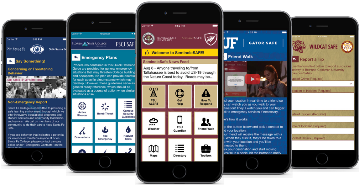
From left to right: Safe Santa Fe (Santa Fe College), FSCJ Safe (Florida State College - Jacksonville), SeminoleSAFE (Florida State University), Gator Safe (University of Florida), Wildcat Safe (Bethune-Cookman University)

Join the hundreds of institutions across the globe including many in Florida that have chosen AppArmor for their custom safety app