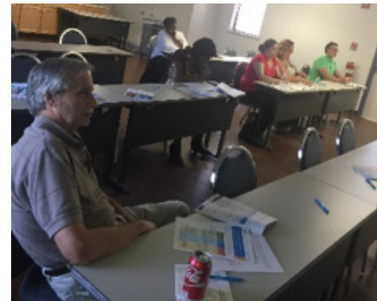
College employees at AFC/VALIC retirement workshop