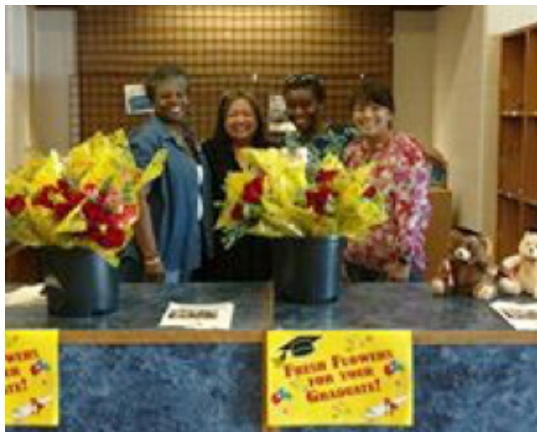
Chapter Members sold flowers and teddy bears at graduation.