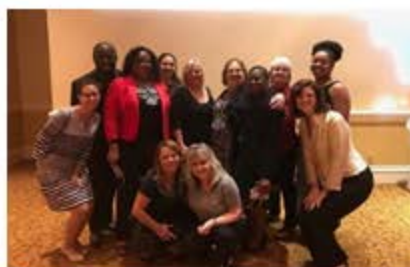
AFC Members at the 2017 Annual Conference