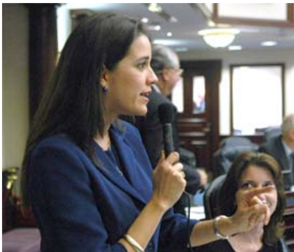
Rep. Anitere Flores, R-Miami

On March 20 th , HB 289 (Flores) was heard in the Postsecondary Education Committee and several FJCCSGA representatives testified in favor of the bill. HB 289 supports the sales tax exemption, but also attempts to address the larger issue of the cost of textbooks. The bill requires a study to be completed regarding textbook prices, and to identify policies and practices that might help reduce the costs. The bill also restricts postsecondary employees from benefiting from textbook selection. HB 289 will be heard in the Schools and Learning Council in the House on March 27 th .